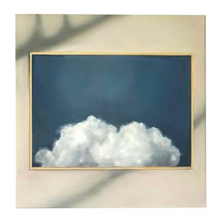
Filio Galvez Untitled, R.I.S Series, 2020 Oil on canvas 24 x 24 in.