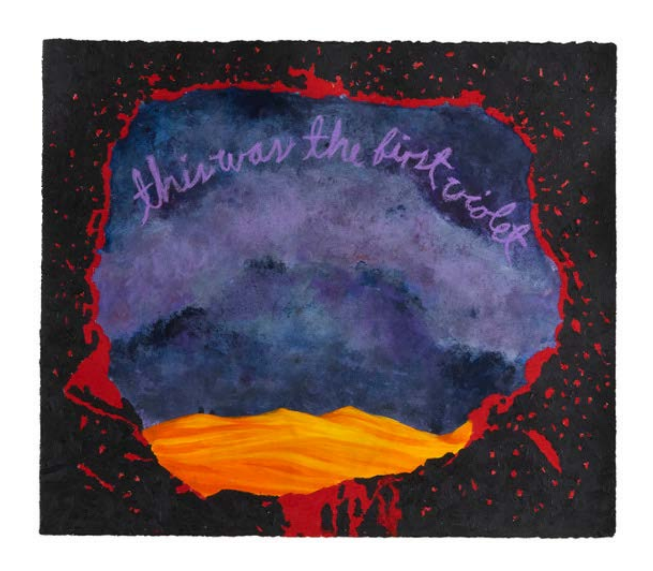
Jorge Rios This Was The First Violet, 2020 Watercolor on paper 26 x 30 in.