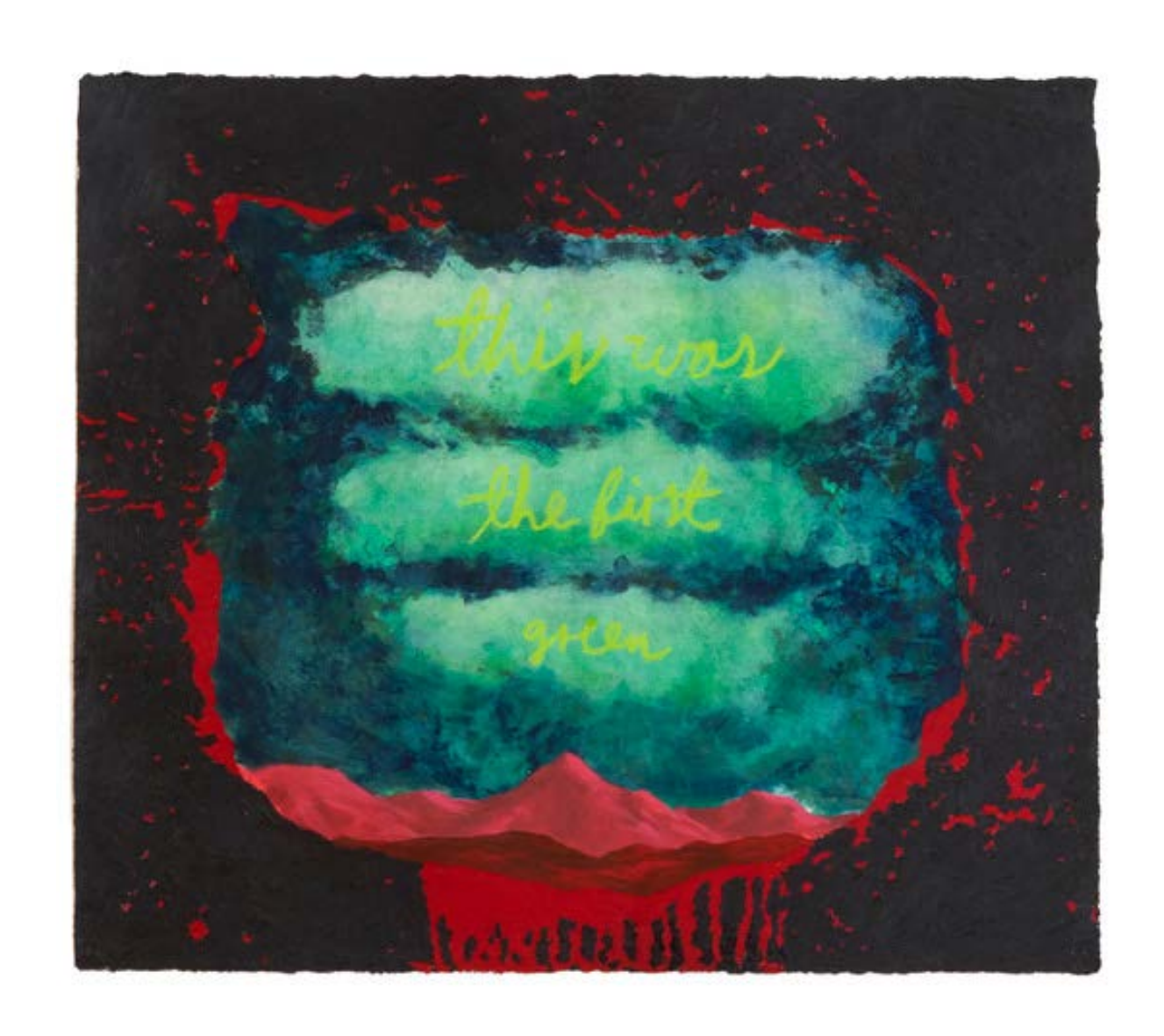
Jorge Rios This Was The First Green , 2020 Watercolor on paper 26 x 30 in.