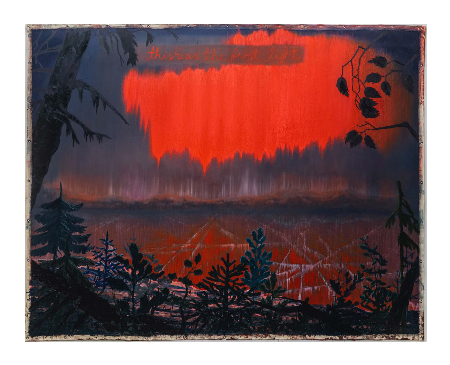
Jorge Rios This Was The First Light, 2020 Oil on canvas banner 96 x 120 in.