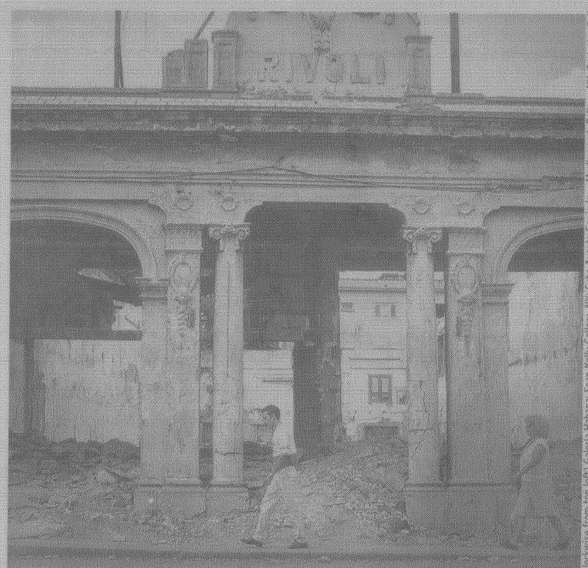
Visions of Cuba: Clockwise from top left: Estero Segura, 'donde el silencio produce tornados' (2000); Los Carpinteros, '5ta Avenida,' 2008; Carlos Garaicoa, 'Rivoli, or the Place Where Blood Flows,' 2002; Tomás Sánchez, 'Cascada con dos Contempladores,' 2008.

land, such as isolation and the sea: Rafts, towers and oars are frequent symbols. Lately more of the art has also tried to address global concerns like immigration and the economy. Photographer Juan Pablo Ballester, now living in Spain, hires porn actors to pose in Catalan police uniforms as a sly political critique.