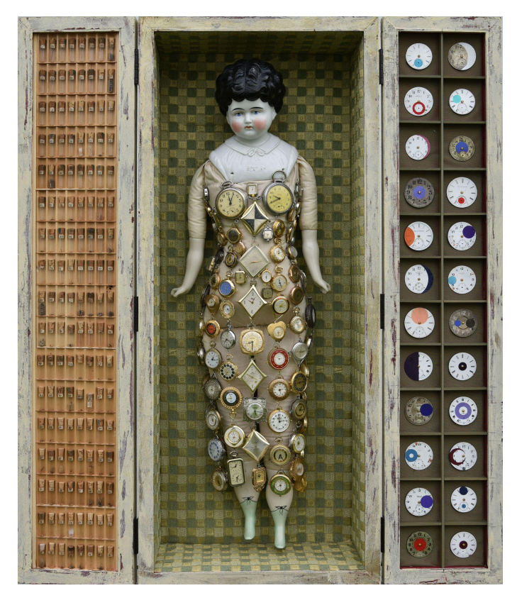
Carlos Estevez. Timekeeper, 2020. Assemblage, 32 3/4 x 28 1/4 x 5 1/2 in.